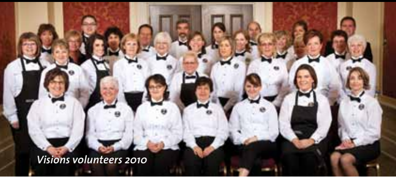
Visions volunteers 2010