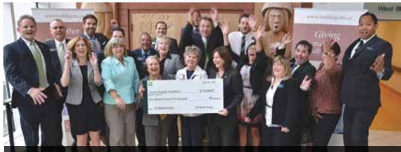
This June TD made a $125,000 pledge to our Building Care Together campaign. They have committed to donate $25,000 a year for the next five years to support essential training for more than 1,200 nurses and caregivers.

and technology to quickly and accurately diagnose patients with cancer, Alzheimer's disease, severe infections or bone pain. The Gamma-CT Scanner will help patients from all over Vancouver Island and BC. Thank you for your contributions to our hospital and your compassion for patients!