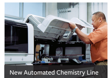
New Automated Chemistry Line

Visions guests have already supported the funding of the new Automated Chemistry Line, and we thank them deeply. We still need our community's help to raise the remaining cost to fully fund this crucial equipment piece. Visit victoriahf.ca/donate .