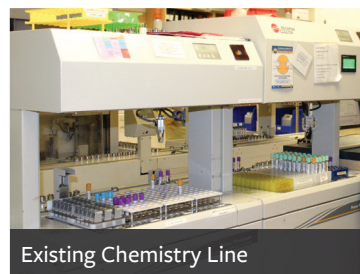
Existing Chemistry Line

The existing Chemistry Line at Royal Jubilee Hospital is over 20 years old, and is the most-used piece of equipment across all of Island Health. This equipment is responsible for conducting tests on patient samples—such as the measurement of salts, sugars, and the essential elements in your blood. The current Chemistry Line can perform 1,000 tests per day, whereas the new Automated Chemistry Line can perform over 1,200 tests per hour.