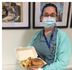
Staff at RJH enjoyed a delicious DeadBeetz burger dinner thanks to Thrifty Foods.