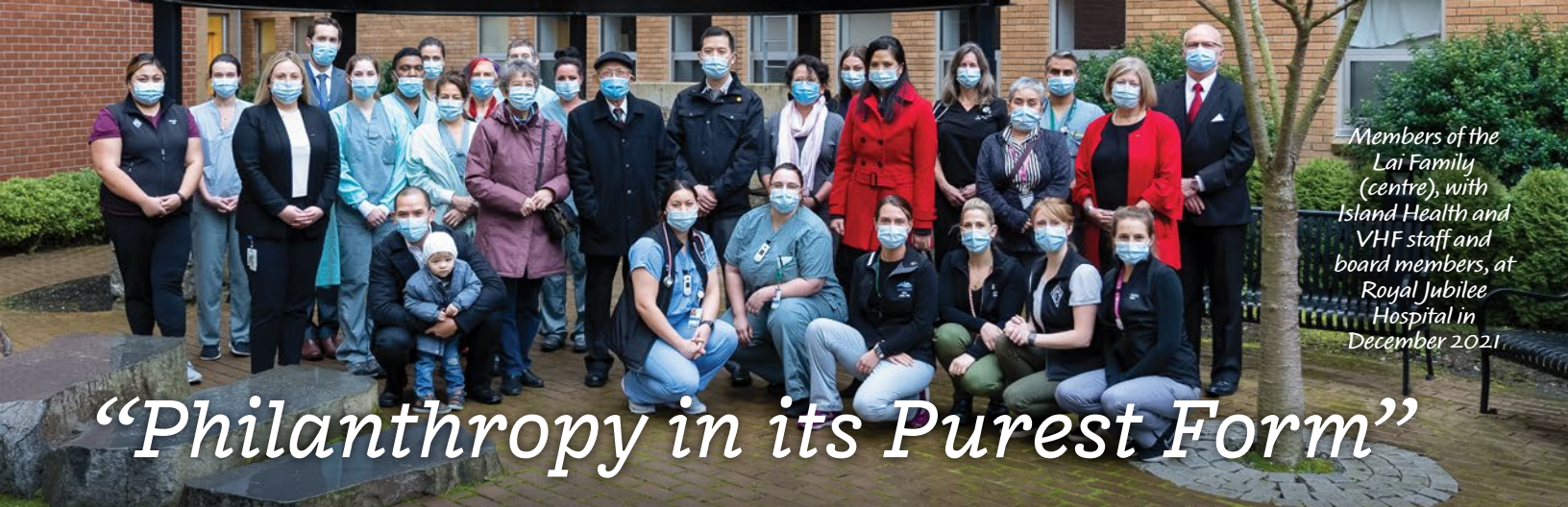
Members of the Lai Family (centre), with Island Health and VHF staff and board members, at Royal Jubilee Hospital in December 2021