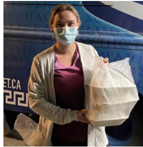
Care teams from VGH were treated to a delicious meal from the Greek on the Street food truck last November, all thanks to Coast Capital.

“Coast Capital was delighted to support Hospital Heroes Week . We wish to give a virtual standing ovation, with loud shouts of cheers, to the frontline hospital care teams for their dedication and perseverance. The care shown our families, neighbours, co-workers and community is truly a gift not to be taken for granted. Thank you for all the work, care, comfort, attention, cheer, relief, and reassurance you have provided the community, especially through these unprecedented times. While this is a simple thanks, it is given with