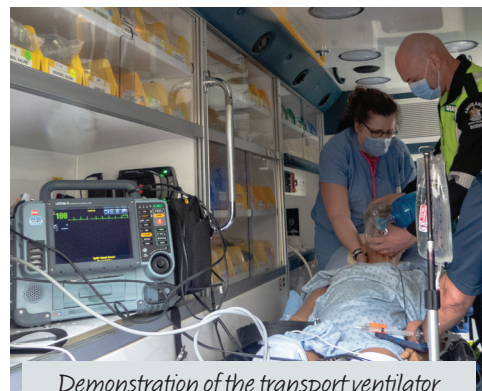
Demonstration of the transport ventilator in ambulance